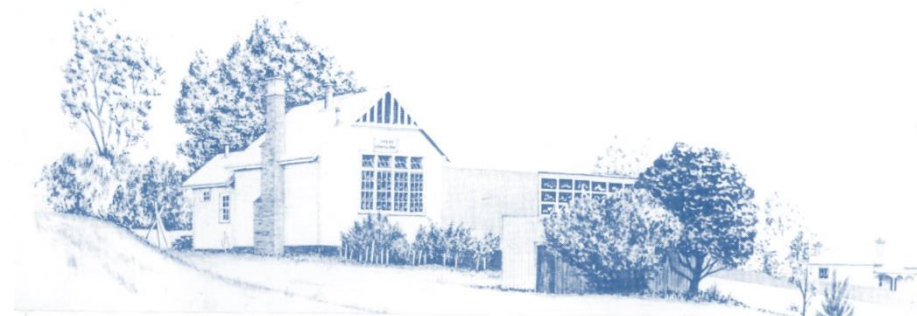
Tyers Primary School (Est'd 1879)

'Remembering the past, learning for the future'